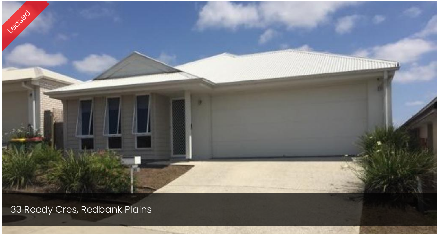
33 Reedy Cres, Redbank Plains