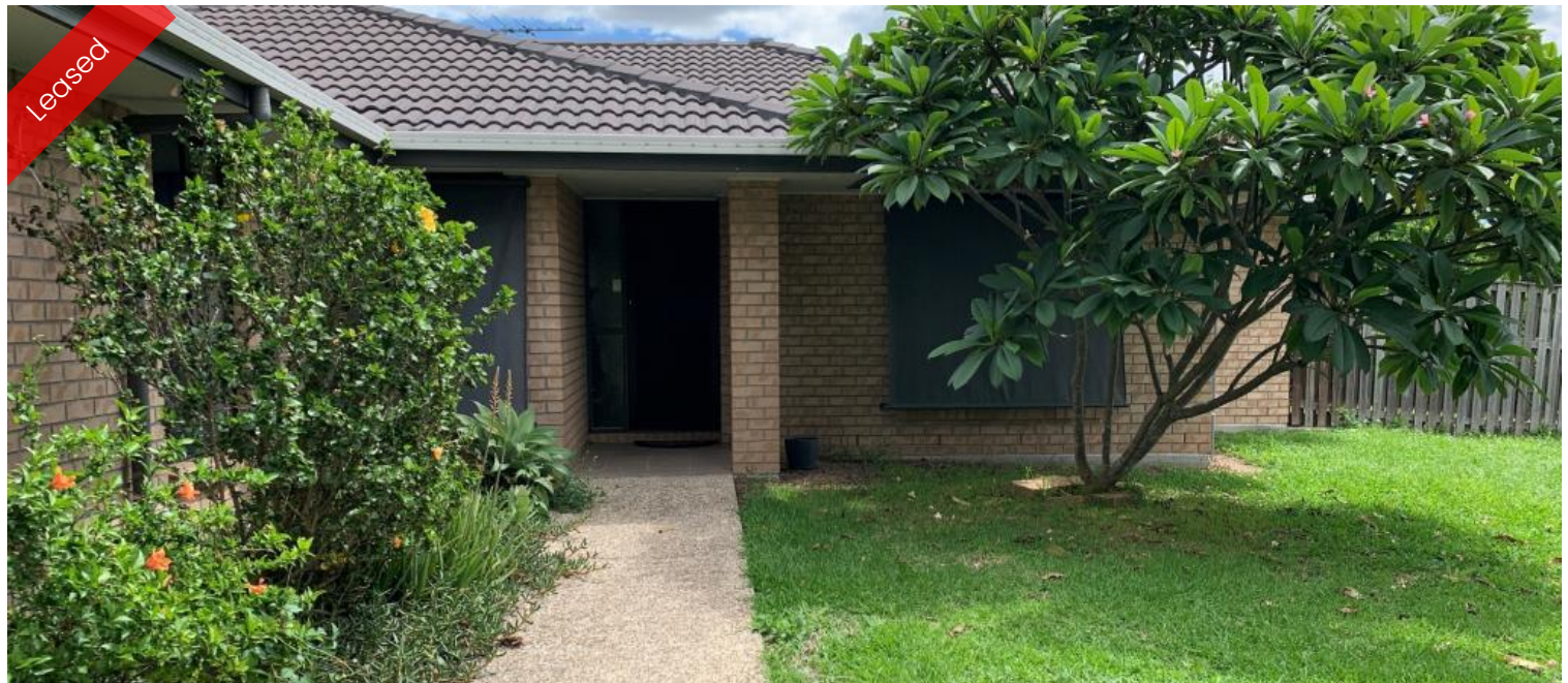
8 Schoffield Ct, Redbank Plains