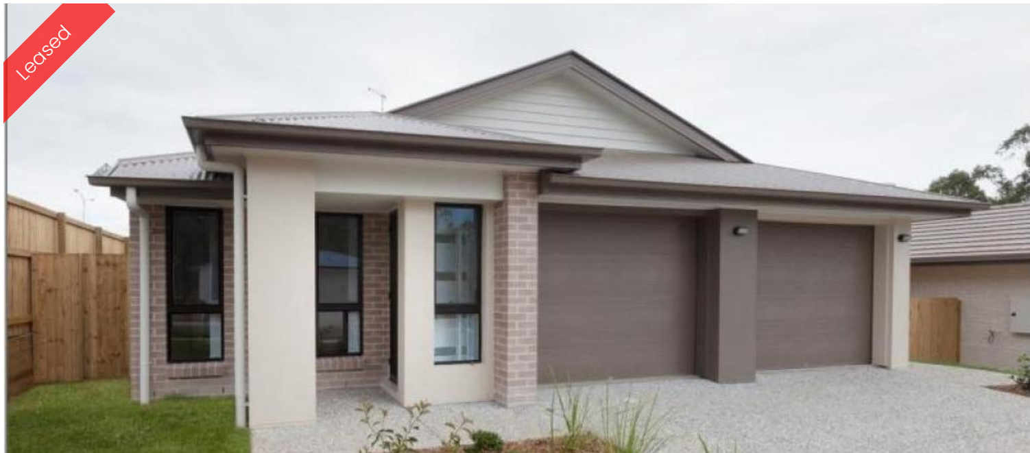
Duplex 1/5 Arburry Cres, Brassall