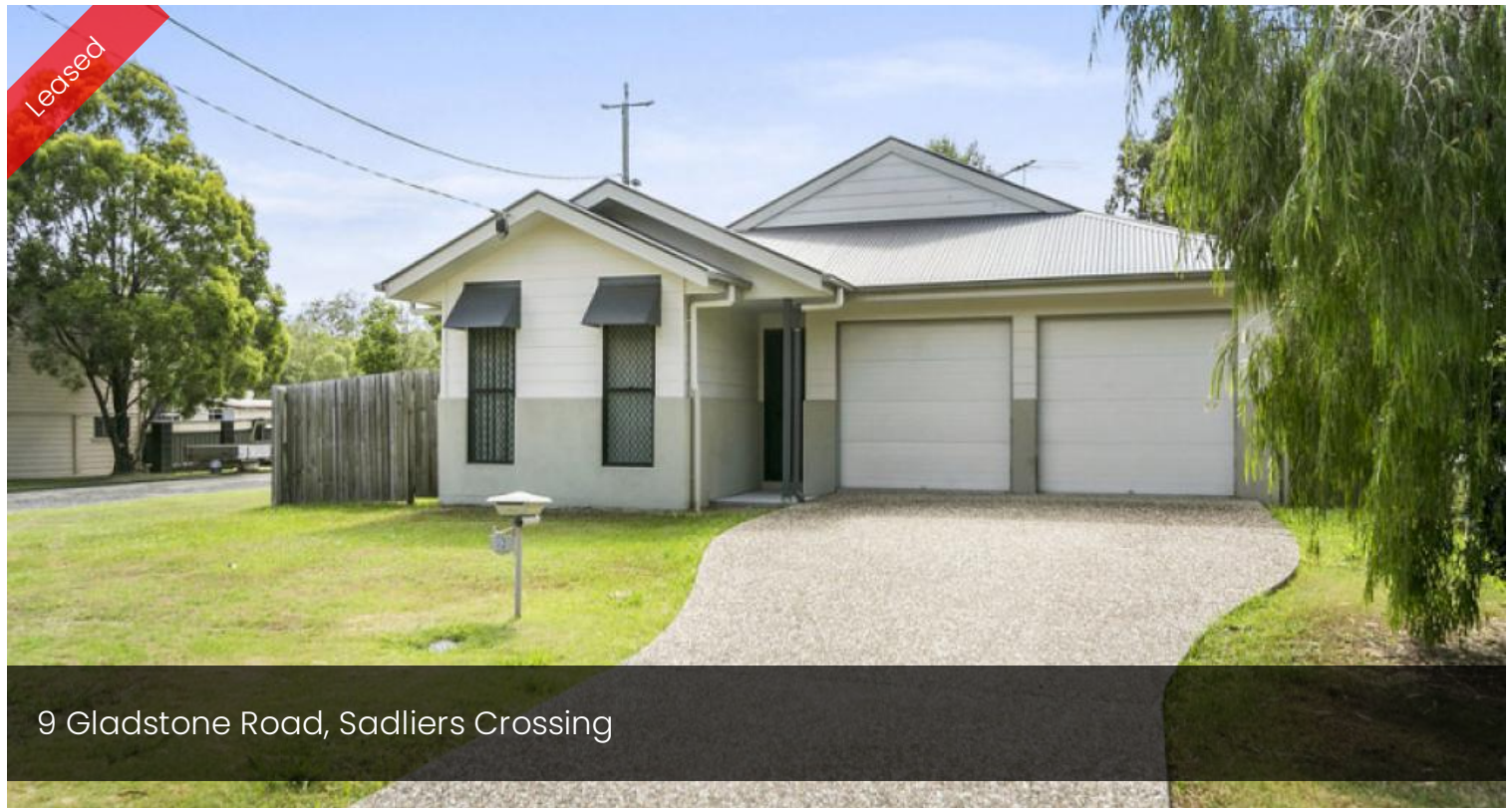
9 Gladstone Road, Sadliers Crossing